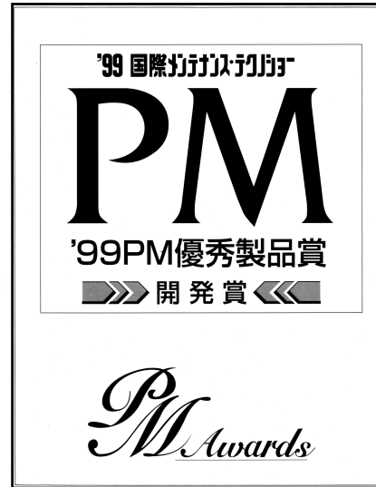
Clamp Nut Plant Maintenance Award Japan 1999