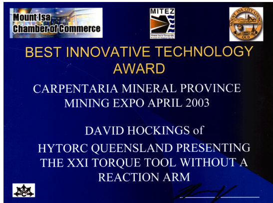
XXI and DISC Best Innovative Technology Award Australia 2003