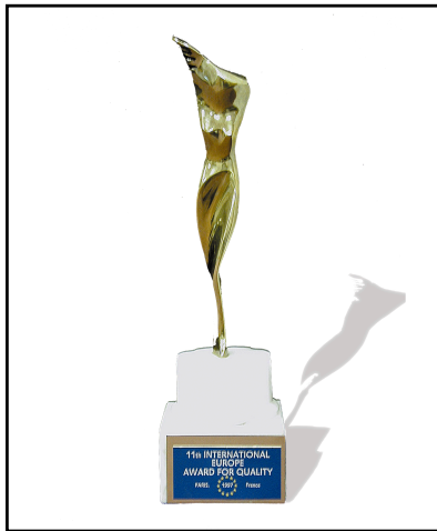
Clamp Nut International Award for Quality Europe 1997