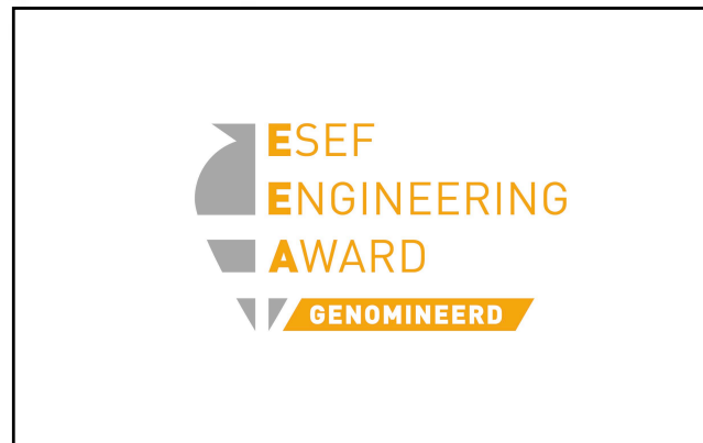
XXI and DISC European Engineering Award Netherlands 2004