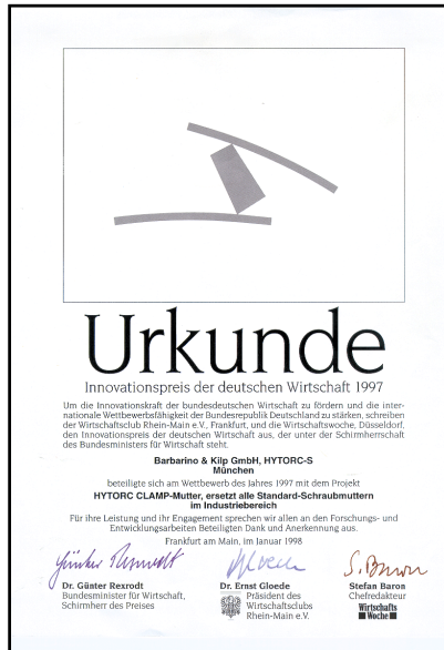
Clamp Nut Innovative Product Award Germany 1998